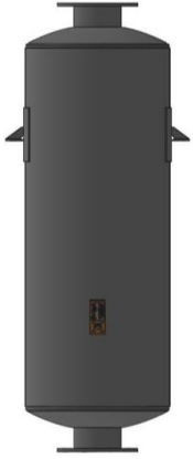
Vertical Type 85-V